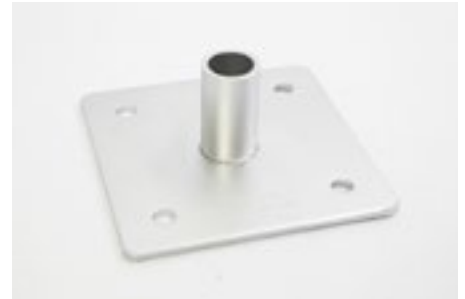
Plate 150mm square x 5mm thickness

Pipe 32mm diameter x 60mm height x 3.2mm thickness