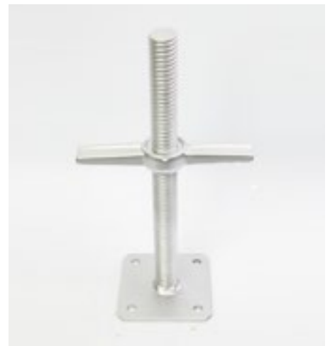
Plate 135mm square x 5mm thickness